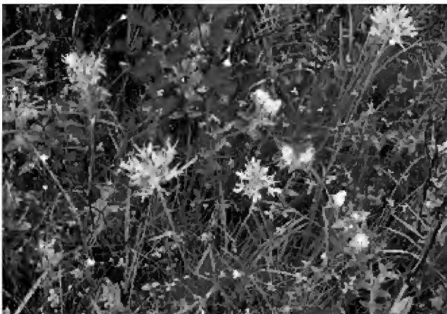
Figure 4. Virginia meadow-beauty, redroot and yellow-eyed grass, growing together to form a dense turf near an un-named pond east of Sandy Pond.

grass, horned beakrush (Figure 1), swamp azalea and fibrous bladderwort, and was excited to see some of the coastal plains species that are exceedingly rare in Canada, occurring mostly only in the province of Nova Scotia, e.g., redroot (Figure 2), threadleaf sundew, zigzag bladderwort, sweet pepperbush, and swamp clubmoss (the latter known in Canada also in Newfoundland). We undoubtedly saw slender (twisted) yellow-eyed grass and rush bladderwort there, but I can't add them to my life list since I hadn't done sufficient homework to be able to conclusively identify either species in the field, and we didn't collect any specimens. Other emergent/aquatic species already familiar to me included Virginia meadow-beauty (limited in Canada to Ontario and Nova Scotia), yellow-eyed grass, horned bladderwort, purple bladderwort (Figure 3), Canadian St. Johnswort, brown beakrush, brownish beakrush, white beakrush, spatulate-leaf sundew, roundleaf sundew, sweetgale, marsh St. Johnswort, twig rush, bayonet rush, yellow screwstem, Robbins' spikerush and pipewort. A sizeable flock of tree swallows was actively hunting low over the pond, undaunted by the heavy rain. Eager not to miss out on the chance to capture digital images of Sandy Pond's rich emergent aquatic flora, my camera made frequent, albeit furtive, forays from under my raincoat, the torrential downpour adding to the challenges of low-light photography.